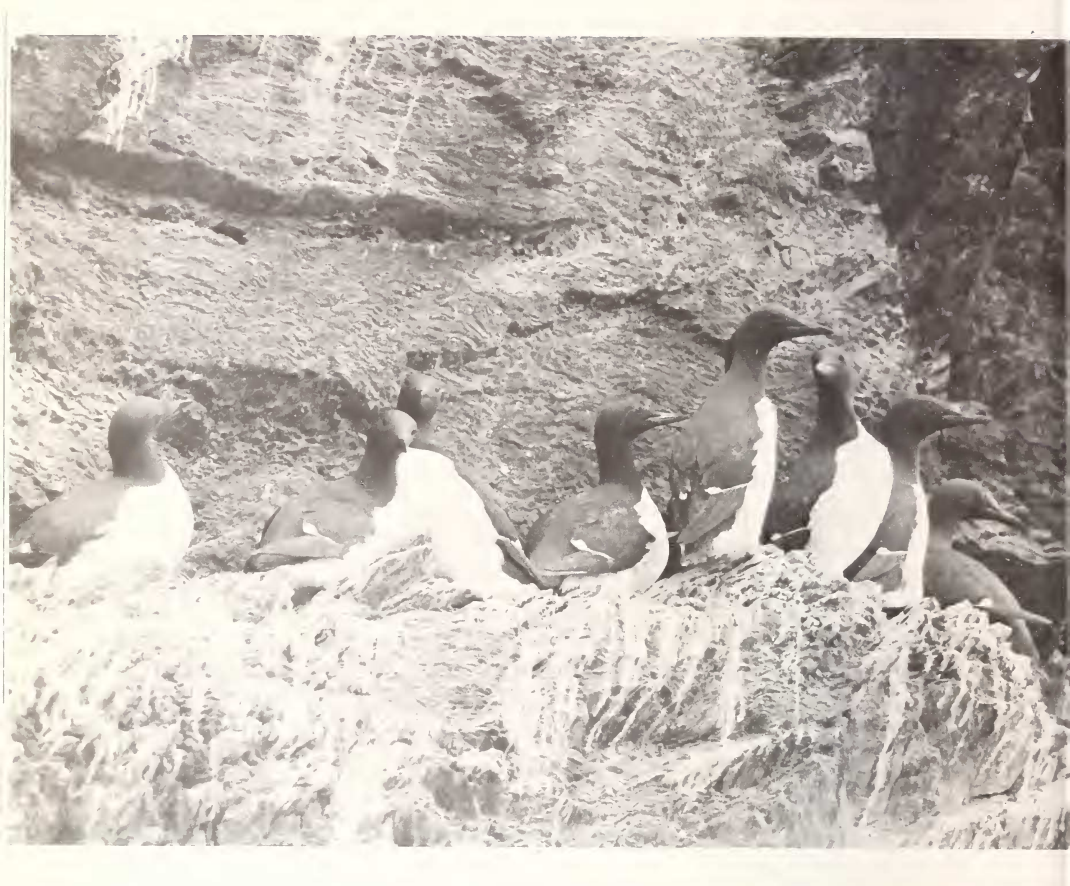
Fig. 19. Common murres on nesting ledge typical of those found along coastal cliffs and islands, 1973.

photo), Shaiak Island (MHD photo; MRP photo), High Island, Twin Islands, Black Rock, and Round Island.